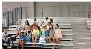
All Red Earth Art Winners together at the Awards Ceremony.

Congratulations to all the Edmond students!